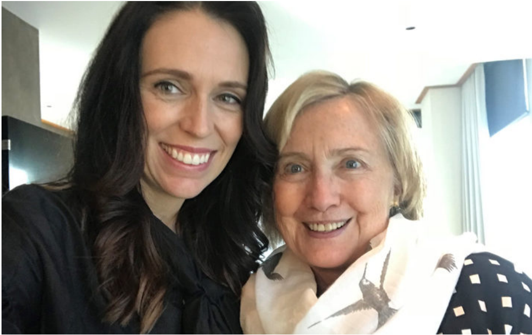
You-know-who with Hillary Clinton.

Among the list of 22 are Bill Gates, Trudeau, Macron, Austrian Chancellor Kurz, Australian health minister Hunt, and Merkel. There is just one New Zealander on the list; you guessed it – Ardern.