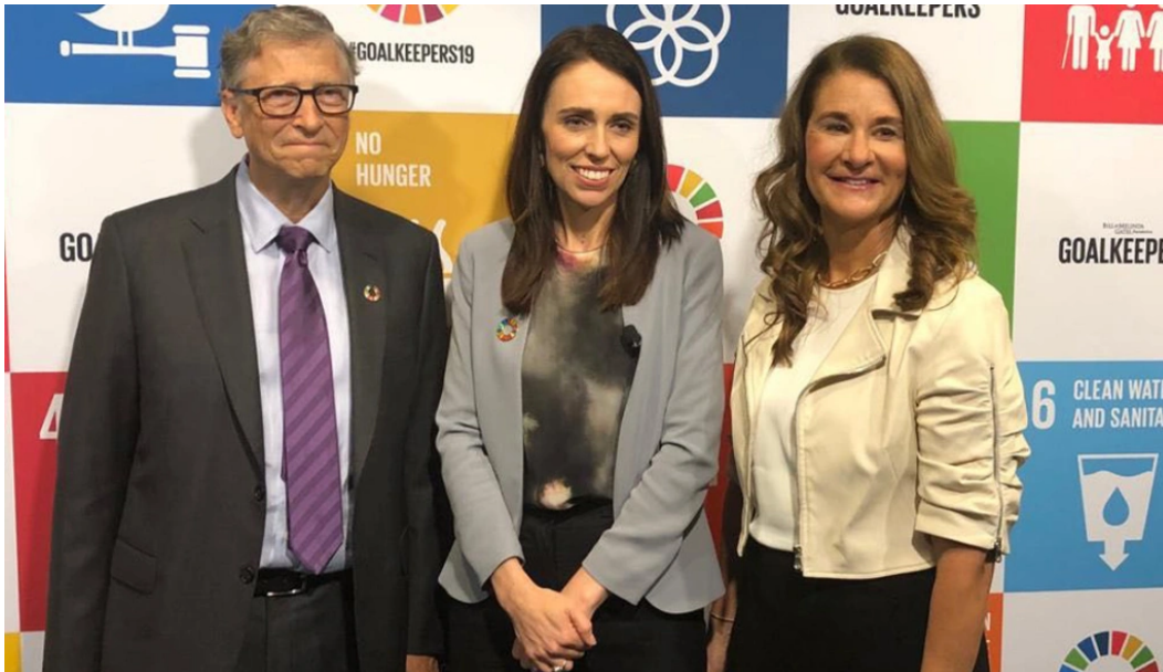
You-know-who with the Gates.

Bill Gates is also in trouble in India. The Gates Foundation funded a programme in 2009 of testing and sterilising indigenous vaccines on tribal children in India. It is claimed that the BMGF (Bill and Melinda Gates Foundation), conducted unlawful clinical trials of vaccine on tribal children in India without consent of their parents. They administered the Human Papillomavirus (HPV), to 14,000 tribal girls aged between 10 and 14. Many fell ill and four died. Their families did not know their children were being administered with the vaccine.